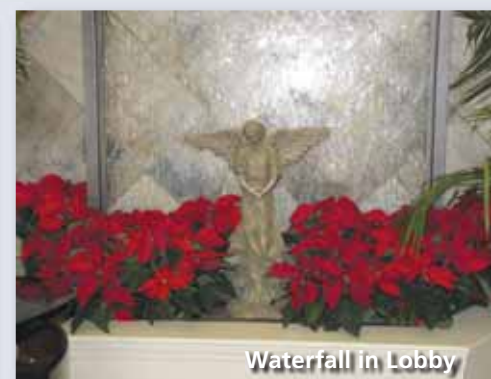
Waterfall in Lobby