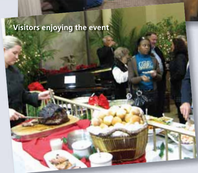
Visitors enjoying the event