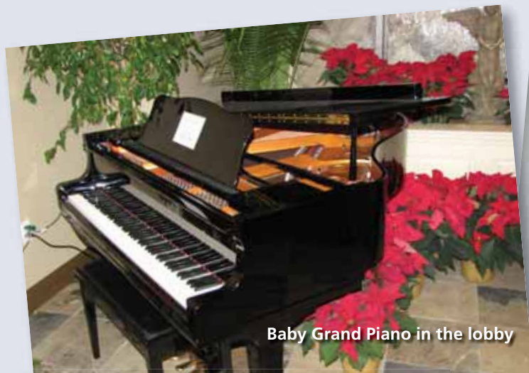
Baby Grand Piano in the lobby