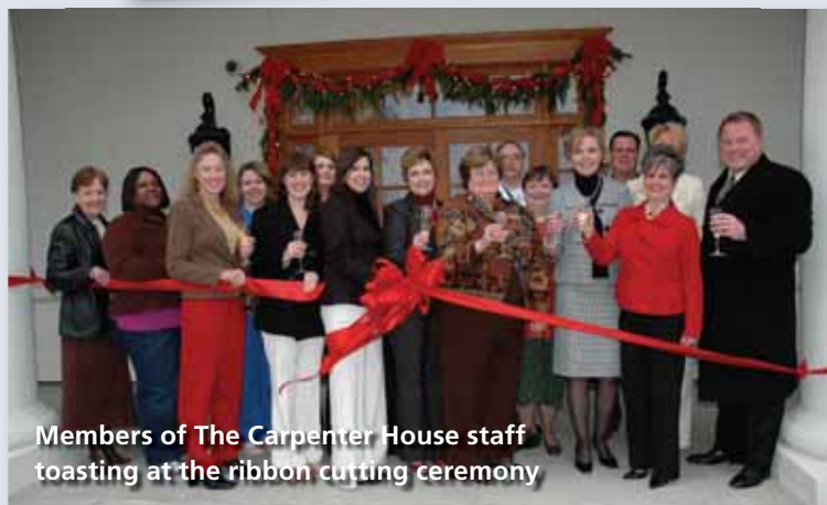
Members of The Carpenter House staff toasting at the ribbon cutting ceremony