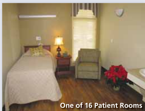
One of 16 Patient Rooms